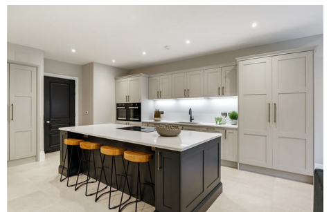
Rosemont, 50 Copsem Lane, Esher, KT10 9HJ Price Guide £1,895,000 Freehold